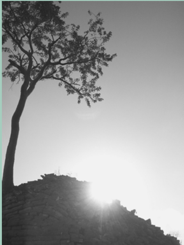
Sun setting over the Lubantuun, an ancient Maya ruin in Honduras.

Although SHI plans to make this twice a year newsletter longer, we did not have the funds to do so this time. If funding increases, we will publish a full-length La Cosecha in September.