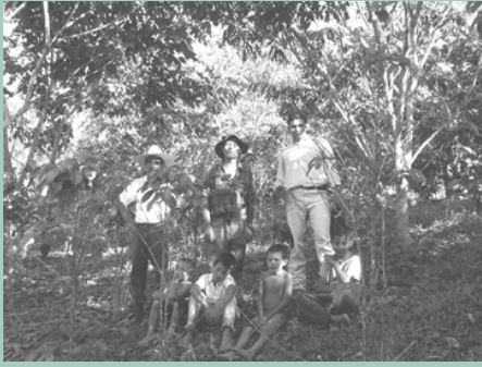
SHI participants standing proudly on their reforested farm.